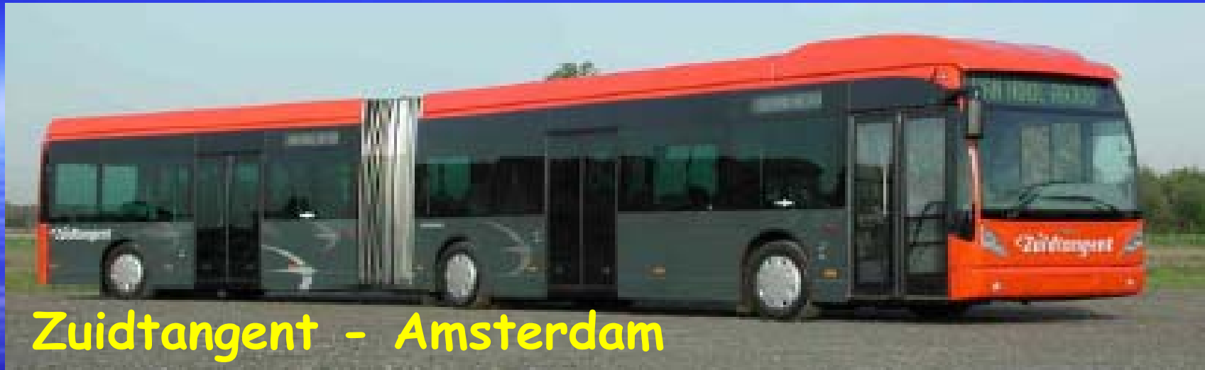
Zuidtangent - Amsterdam