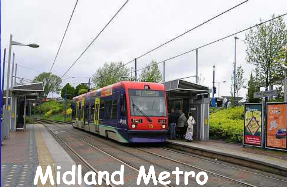
Midland Metro Extensions